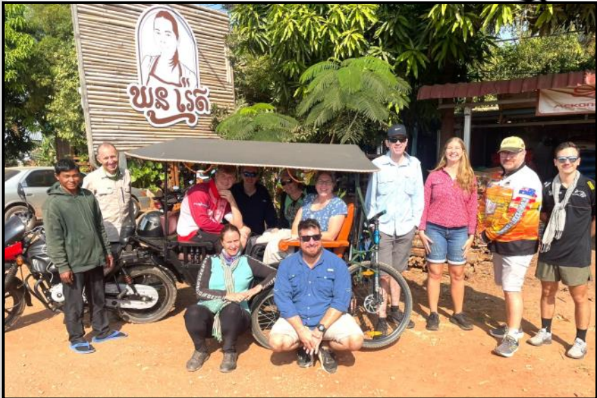
Darwin Baptist Team Visit Cambodia Pages 4&5