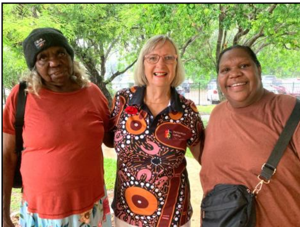
Continuing Students at Nungalingya