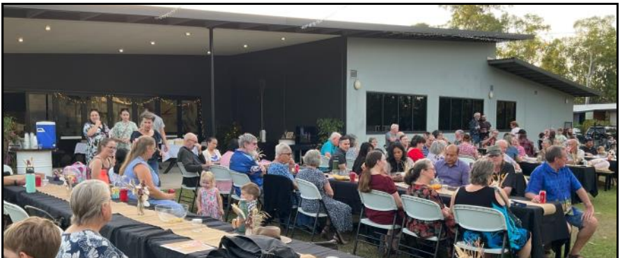
Celebrating Cornerstone's 20 years with dinner and fellowship