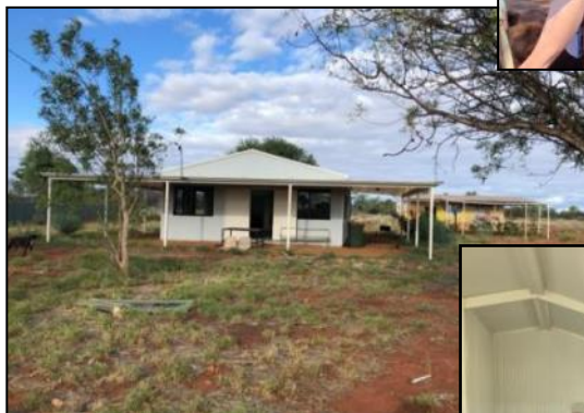
Murray Downs has opened a new church building, paid for by the Central Desert Land Council.