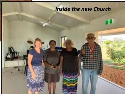
Inside the new Church