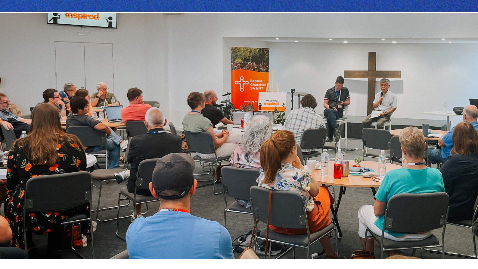
Above: Baptist leaders gather at West Beach Community Church and online to hear about Alpha and Mission 25