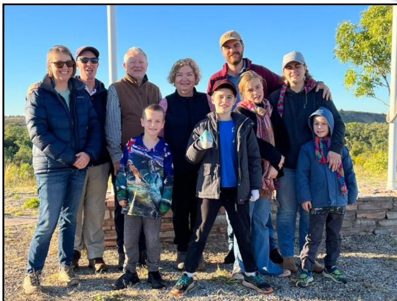
The Outback Team gather at Kalkarindji