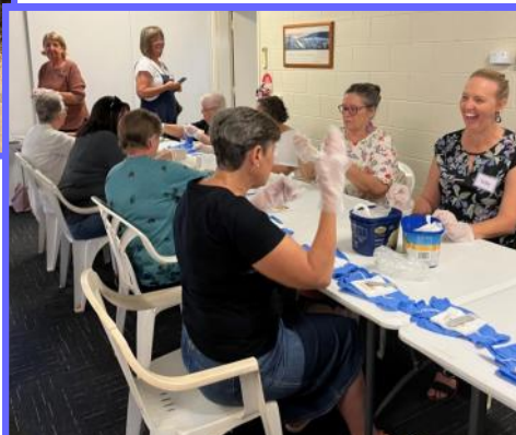
Assembling Birthing Kits