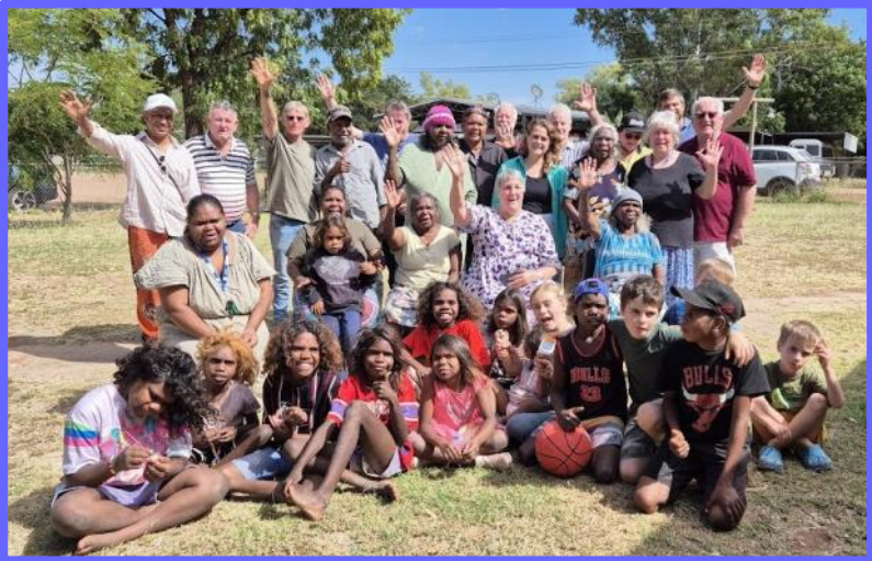
Lismore Baptist Work Party take a moment to relax with Kalkarindji locals