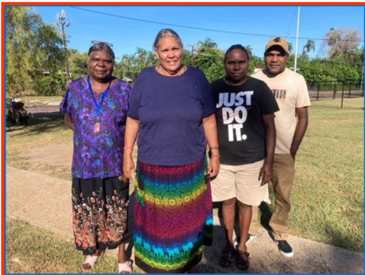
Lajamanu Church Members studying at Nungalinga College