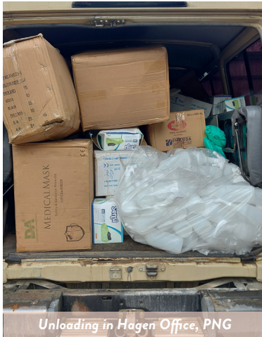
Unloading in Hagen Office, PNG

Highlighted by the surge of COVID-19 in PNG and South Asia, emergencies around the world underline the scale of global need, requiring immediate responses from relief and development organisations like Baptist World Aid Australia