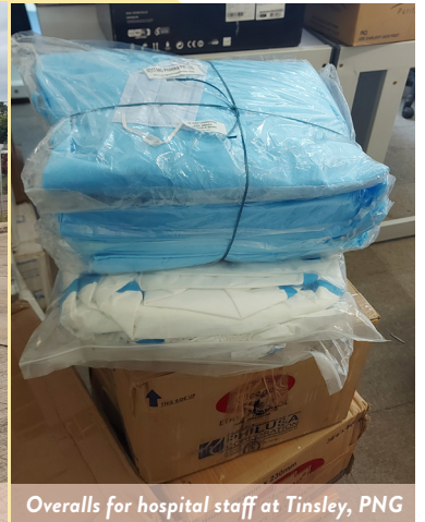
Overalls for hospital staff at Tinsley, PNG

When Baptist-run hospitals were set to close in PNG and India, Baptist World Aid launched two urgent appeals to offer immediate help. Both were in addition to our general COVID-19 Global appeal.