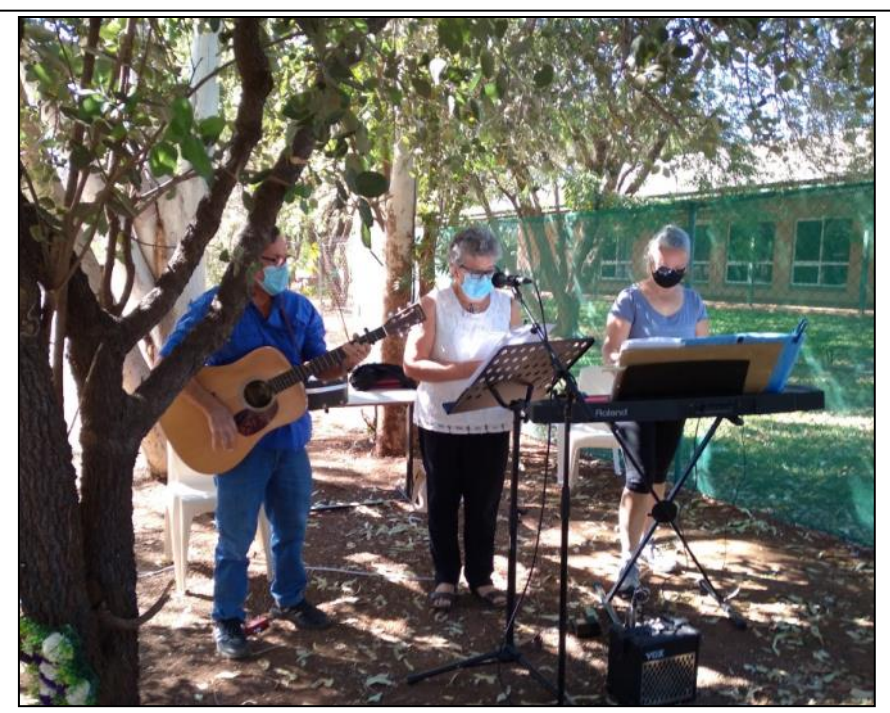
KBC Musicians playing outdoors during the recent lockdown