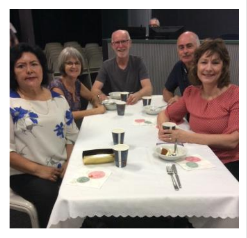
Great Fellowship around the table

It was indeed a memorable and blessed 2021 Assembly.