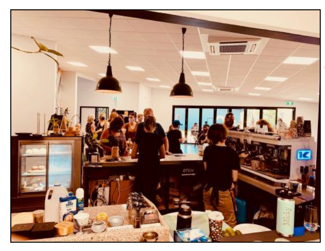
The busy Corner Cafe

The café serves delicious breakfasts, lunches and coffees and is open from Wednesday to Saturday. Corner Cafe is also providing a safe and non-threatening space to which 'churchies' can invite their friends.