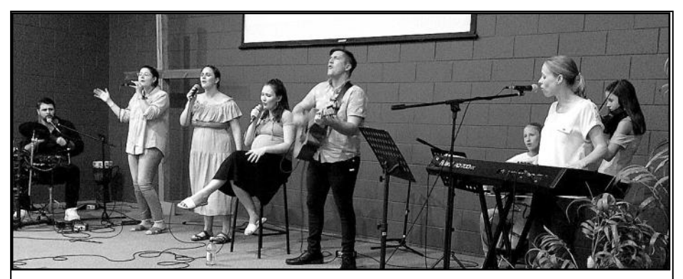
CrossRoads Worship Team leading Praise at this year's BUNT Assembly