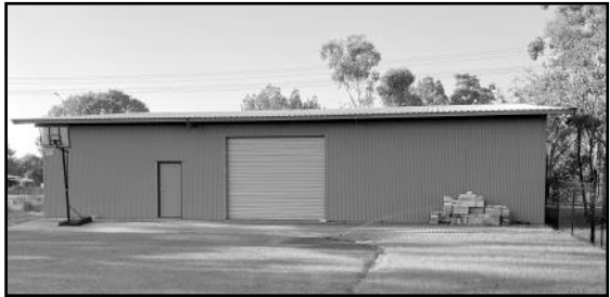
Could this be the next NT Men's Shed ?