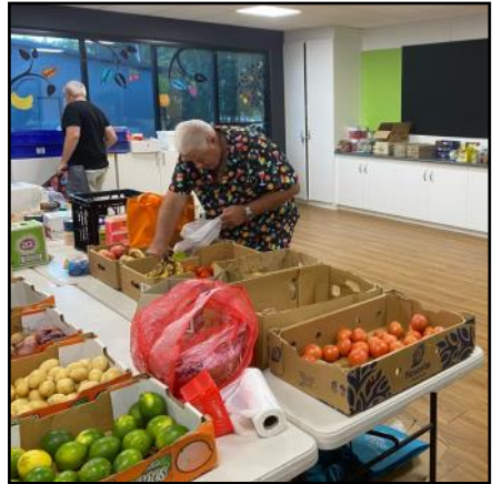
Food for Life Shop and Café at Cornerstone