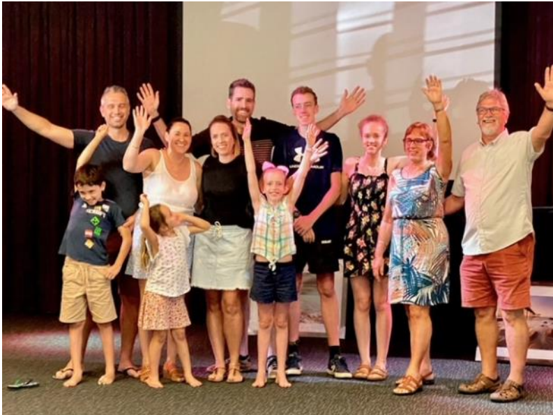
Celebration at Darwin Baptist Church - Pages 4&5