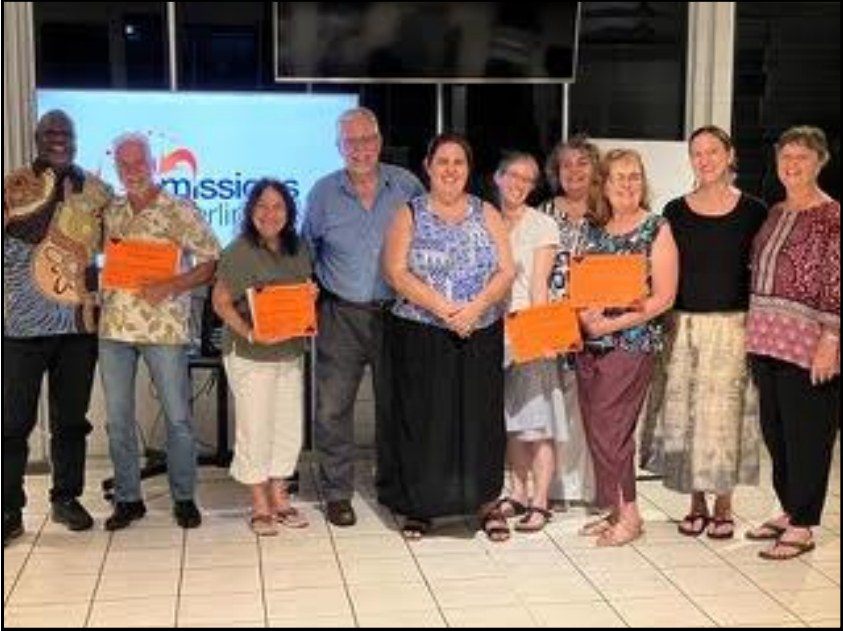
Graduation of 'Transition Training Remote Indigenous Ministries (T-TRIM)' course January 2024 with training held at Nungalinya College. Participants and facilitators from Elcho Island, Nhulunbuy, Cairns and Darwin.