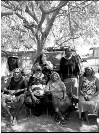
Visiting a Desert Community

Under the Spotfire banner, they led a 20 day trip into several Central Desert communities including Yuendumu, Elliot, Lajamanu and Kalkaringi. In all four situations (Arnhem Land, Central Desert, Timor-Leste, Cambodia) it is exciting to see the on-going relationships developing with the wider Christian community and several individual churches.