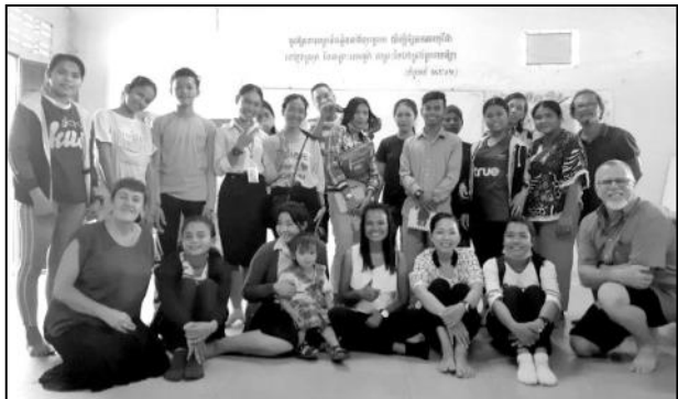
Cambodia: Youth Pastors and Leadership Training