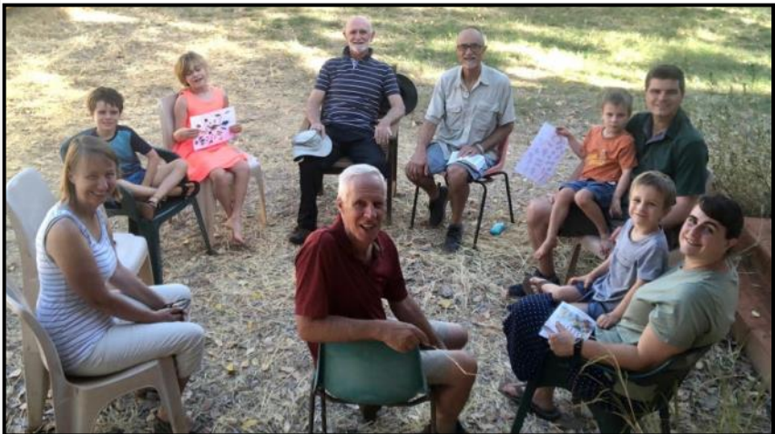
The Outback Team gather at Lajamanu over Easter