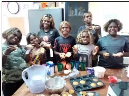
Girl's Discipleship Group enjoy some baking