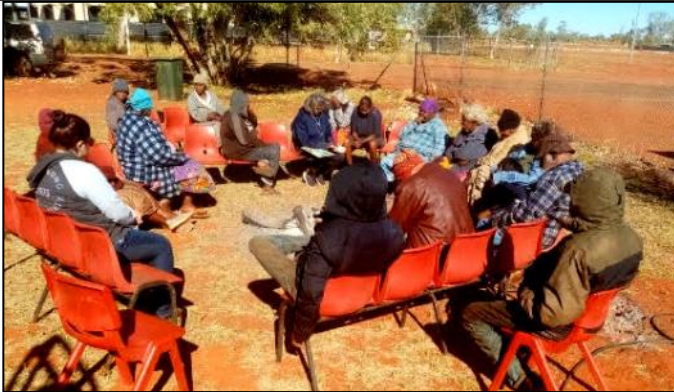
Sunday Church Service