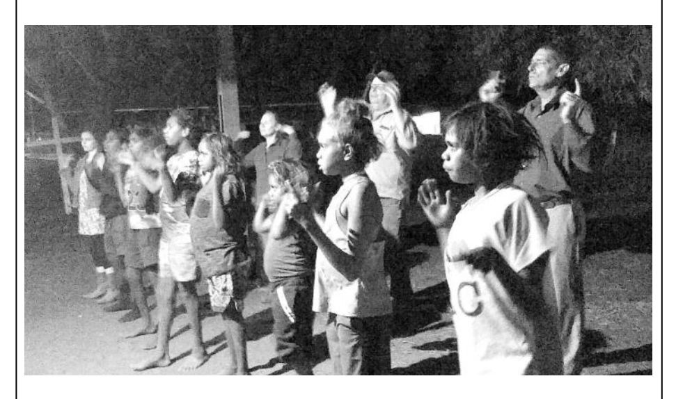
Children and adults join in Action Songs after the Saturday evening Community Feed

On Sunday morning the main Church Service is held and in the evening a shorter service with a Sharing Time and a Singalong. Praise God for the Christians at Ali Curung, for their faithfulness during lockdown time and for their energy and eagerness to make the Church part of everyday community life with Jesus at the centre.