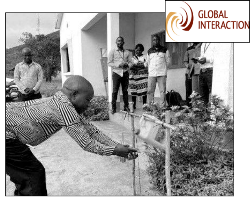
Tippy Taps in Malawi and Mozambique encourage hand washing