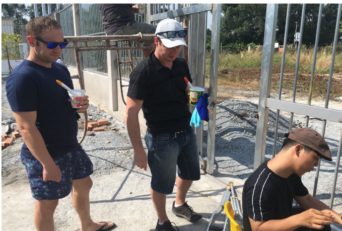
(left) Helping giving the fence at the facility a paint

Continue to pray that COG will effectively outwork the goal of having a clear identity within context of a local church mission.